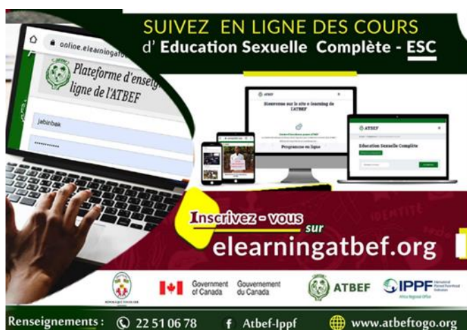
ATBEF's e-learning platform

Started in 2020, an e-learning platform has been developed, allowing users to attend a course based on the IPPF Seven Essential Components of CSE. Users can learn at their own pace and according to their availability, without any constraints. At the end of the course a certificate of completion co-signed by the Ministry of Education, the Ministry of Health and ATBEF is offered to the user at a reasonable price.